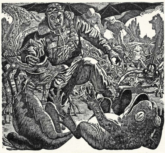
A headless thing with ropy arms and a puckered, mouth-like orifice tried to drag Morris down.

last resort would summon other planes by radio, from one of the American bases in California, to intercept Sakamoto.