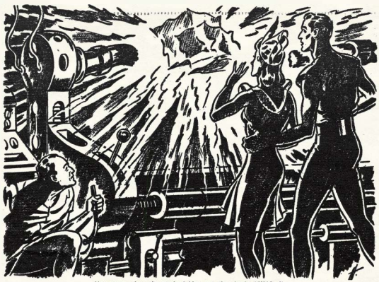
Vera screamed as the overload blew out the circuit (CHAP. I)