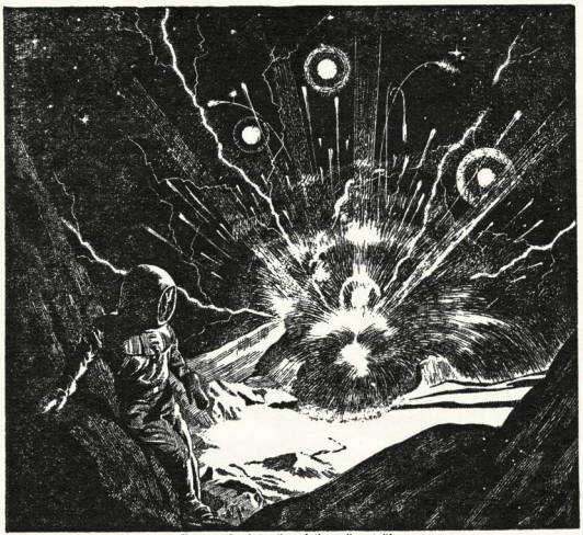
Flan saw the destruction of the malignant life